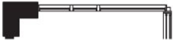
WINDOW SUITES 506, 606