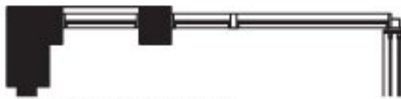
WINDOW SUITES 508, 608